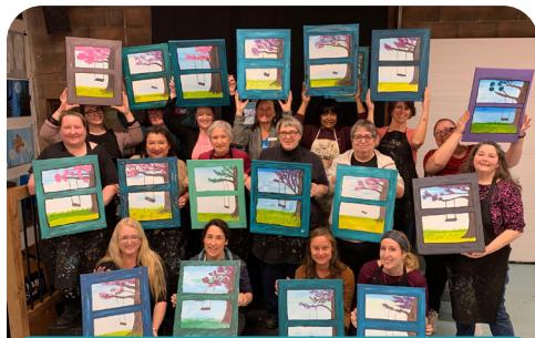
All smiles from Direct Support People at our DSP Appreciation Paint Night in September 2019