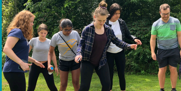
Staff and participants exercising their balancing skills