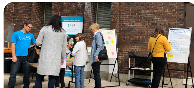
Community members shared their thoughts at On The Table in September 2019