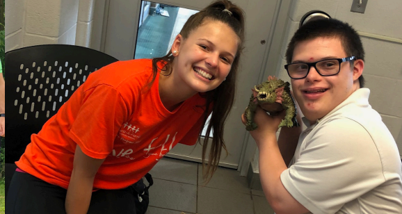
Meeting exotic animals as part of "All Around the World"