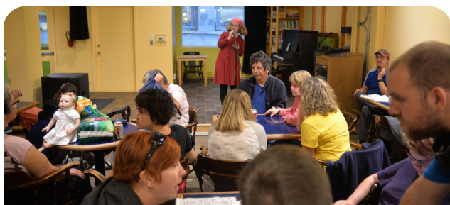
Open Space participants and facilitators enjoying coffee, conversation and music at Open Mic Night