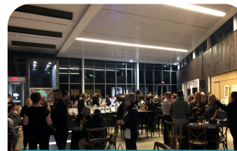
We celebrated the diverse and inclusive neighbourhoods of Waterloo Region at Block Party 2019

Our team worked hard this year to bring high quality, engaging and fun events to our community that raise much needed awareness about disability and bring in funding for our organization so we can continue to provide support to the families we serve. Our focus is always on bringing people together in hopes of fostering new relationships and connections.