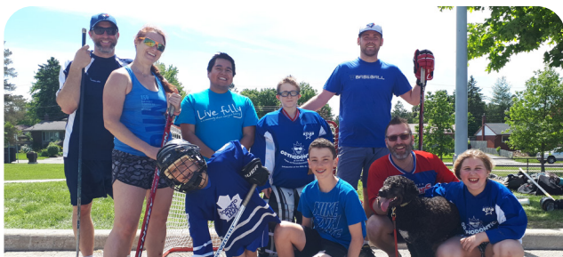
EAFWR hosted its 6th annual Ball Hockey Tournament at Neighbours Day 2019, in partnership with Stanley Park Community Association