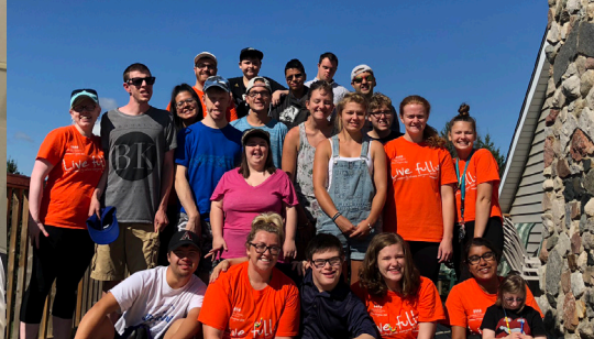
All smiles from our Summer Program 2019 participants and leaders