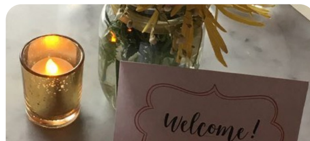
Parents and caregivers enjoyed a night out at On the House, a partnership with Bridges to Belonging and Waterloo Region Family Network