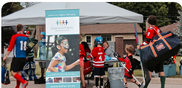
Community members enjoy ball hockey as part of Neighbours Day 2018