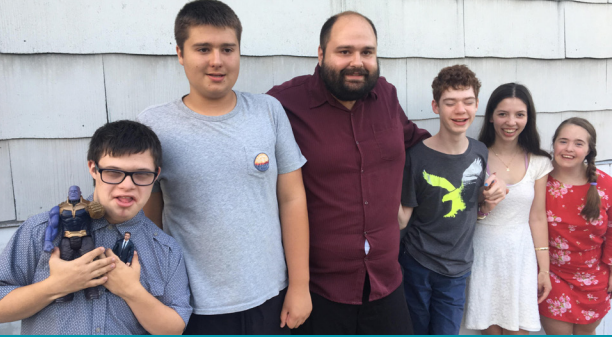
It was a fun-filled week for staff and participants alike