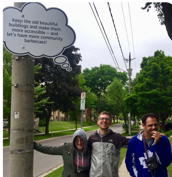
WALES Group members contributed their ideas to the Midtown Thoughts project last fall