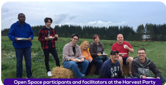
Open Space participants and facilitators at the Harvest Party