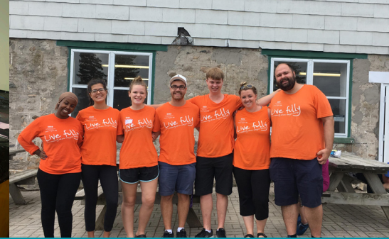
All smiles from our Summer Program 2018 Leaders