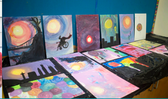
Participants channelled their inner artist at Paint Nite